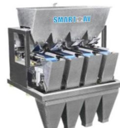
4 Belt Version