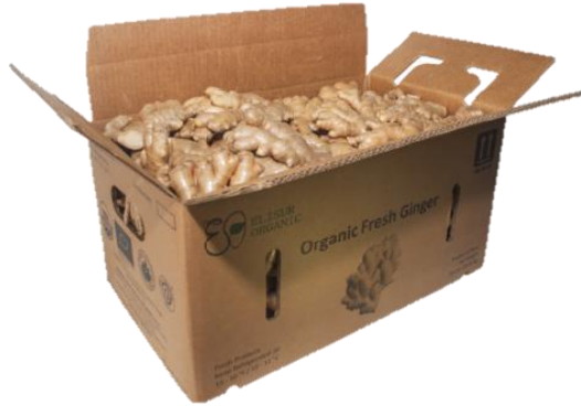
Plastic boxes G5 Weight per box 13.3 Kg. (30 lb.)