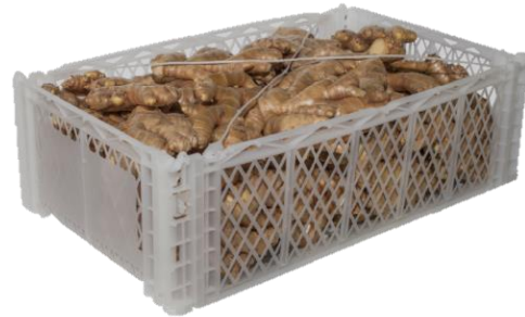
Plastic boxes G5 Weight per box 7, 7.5, 7.7, 8 Kg.